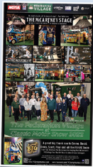
A much-appreciated and colourful message of thanks